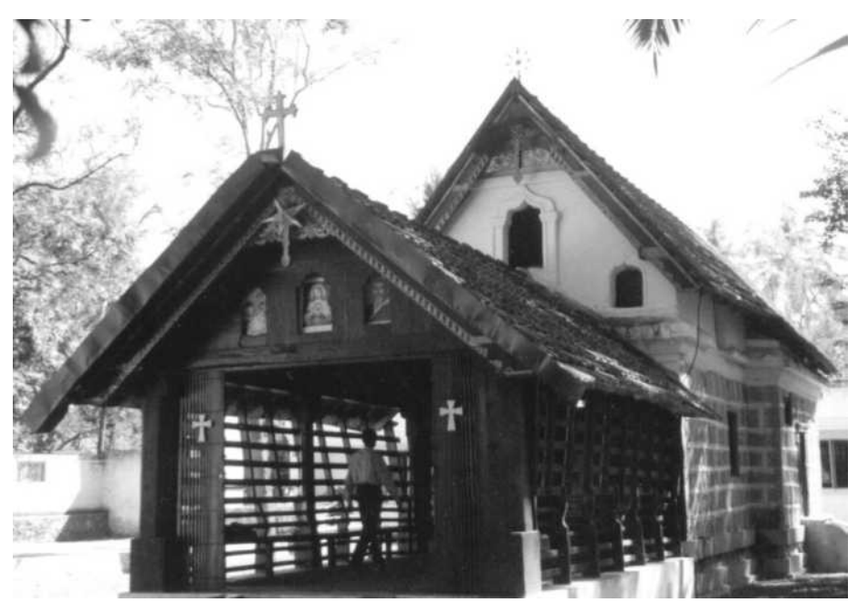
Figure 1: Bamboo and Timber construction in the existing Thiruvithamcode Church.

A Prelude To The Study Of Indigenous, Pre-European, Church Architecture Of Keralas