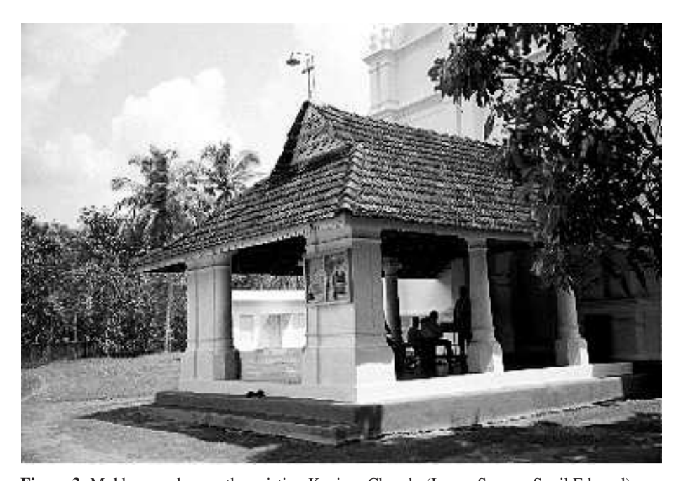
Figure 3: Mukha-mandapam, the existing Kanjoor Church.