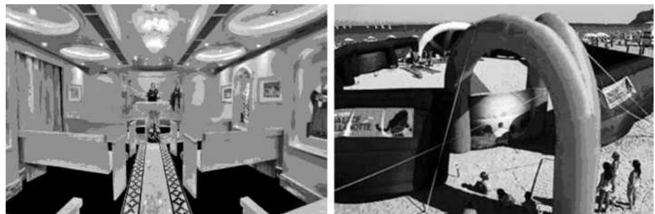
Figure 9: Chapel on the Costa Concordia cruise ship, and, the ultramodern “House of the Lord” in PVC, a portable church 2009 (Image Source: A. Marcuccetti).