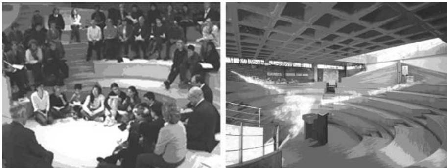
Figure 5: Catholic chapel of Notre-Dame in the Collège Lycée Notre-Dame Providence at Enghien-les-Bains.