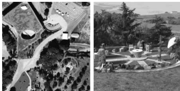
Figure 8: Church for the community Roma and Sinti, Rome