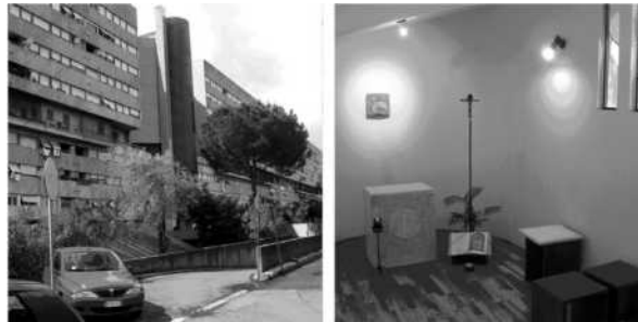
Figure 7: Chapel at Corviale, exterior and interior