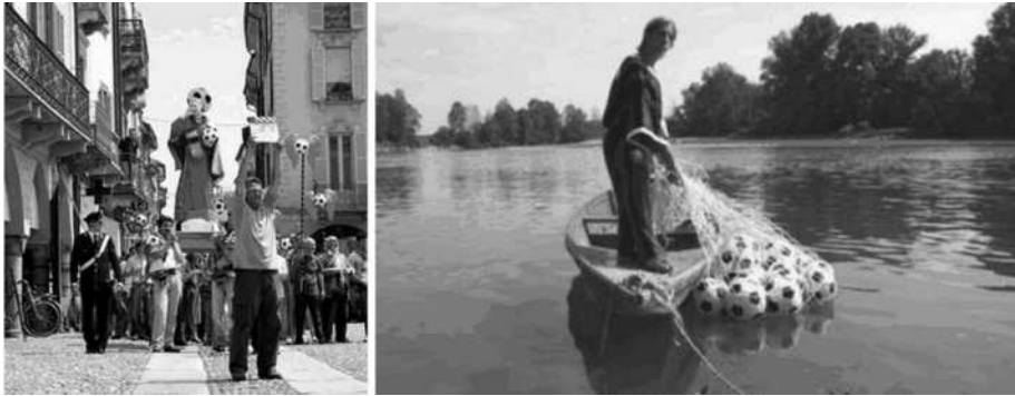
Figure 1: The 2011 TV ad campaign by Sky Italia

At the 2011 Venice Biennale, the Golden Lion was awarded to the German Pavilion, where the artist Christoph Schlingensiefel 17 used the sacred to disparage the sacred, as a way of manifesting his state of mind regarding his existence and the disease that would eventually lead him to his death. In the Italian Pavilion, the sacred was used by Gaetano Pesce 18 as an artistic expression for his work, as in the installation for the town of Salemi.