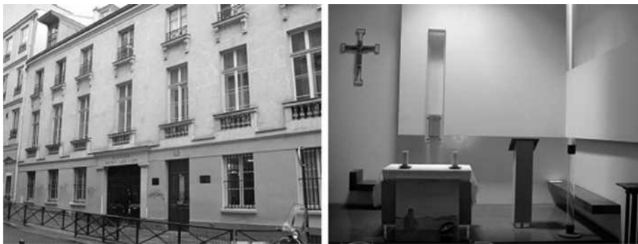
Figure 4: Catholic chapel in the Lycée Rocroy Saint Leon School at Paris. (Image Source: A. Marcuccetti, 2011).