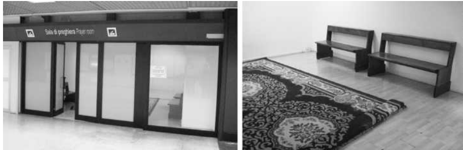
Figure 6: Interconfessional chapel in the Leonardo da Vinci Airport in Rome