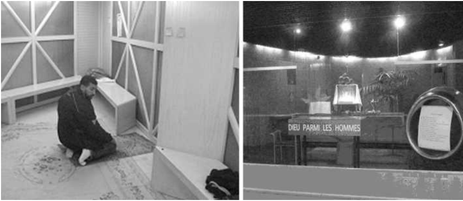
Figure 3: Interconfessional chapel in the airport of Orly West, and the Catholic chapel, airport of Orly South.