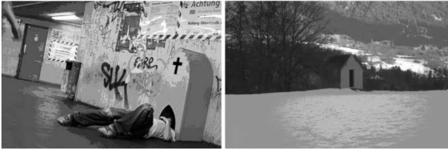
Figure 10: Portable church of San Martino for the homeless by the British artist Dave the Chimp, and, the Kapelle Nepomuk Oberrealta in Switzerland (Image Source: A. Marcuccetti).

The new collective urban spaces have, therefore, increased in number and variety. At weekends, the community would come together, while today it tends to drift apart, thus altering the make-up of the local communities. Places of prayer have started to appear on the flow pathways -- motorways, railway networks and airports, the focal points of modernity where large numbers of people converge. They have been opened in motorway service areas, (such as the Chiesa dell'Autostrada , Motorway Church by Giovanni Michelucci) and the railway stations, as in Roma Termini, where the prayer room is located in the underground shopping forum. In the Gare Montparnasse and Gare de Lyon in Paris, there are two churches, which, in the latter case, also serve as a shelter for the needy. In airports, such as Fiumicino “Leonardo da Vinci” and Paris “Orly West and South”, the type of solution and the location leave a lot to be desired, being hard to reach and badly designed, especially the mosque at Orly South and the interconfessional centre in Rome Fiumicino (Fig. 6).