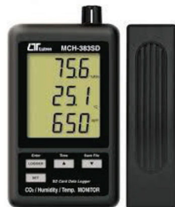
Figure 1: The Carbon Dioxide meter used in the experiment based on NDIR Sensor.

Step 3: The data is tabulated and analysed.