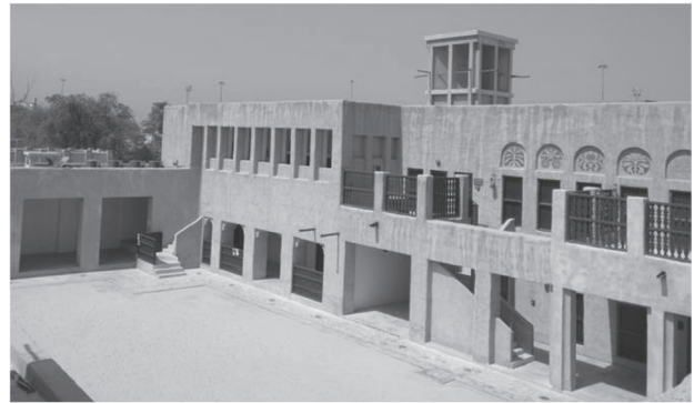
Figure 6: Coral masonry with lime mortar wall.

The traditional materials of construction were mud, stone, wood, thatch and coral. Palm wood planks or mangrove beams were commonly used to support the ceiling. With discovery of oil, the new chapter in the economic transformation of the UAE began. Concrete replaced the traditional building materials. And with time the pattern of the settlements changed to modern day blocks (Hawker, 2002).