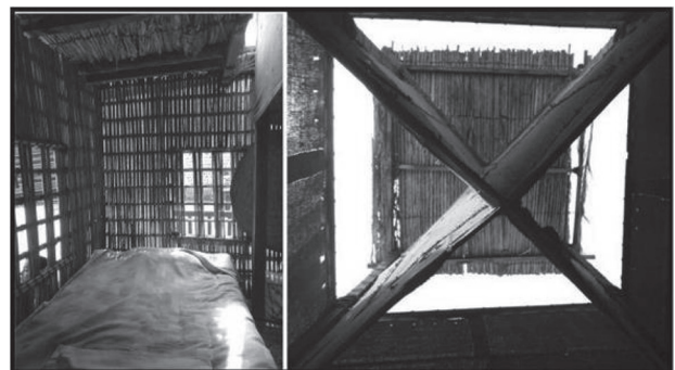
Figure 4: Interiors of tradition vernacular homes of Dubai (left), Windcatcher (right) (Source: Author).

Wind movement is the key element critical to passive cooling. Although the layout and natural materials helped in providing cool interiors, wind catcher towers were also used to improve ventilation. The concept of wind catcher tower was imported from Iran. The wind towers were constructed in an X-shaped design and left open on four sides to catch and push the cooling air to the room beneath (Hawker, 2002).