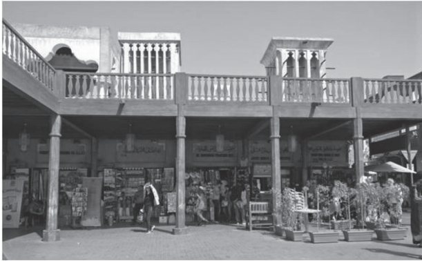
Figure 2: Souks of Deira Dubai.

of Dubai. Deira has developed much since its early days with recent developments of the metro corridor, shopping malls, towers, etc.