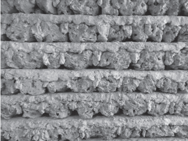
Figure 5: Sheikh Saeed House (Source: Author).

provide shade during much of the day. The vernacular architecture used little or no energy and purely by its design created an ambient and comfortable indoor environment.