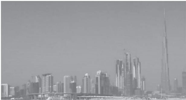
Figure 3: Skyline of Modern Dubai (Source: Author).

Bur Dubai lies to the western side of the Dubai Creek. It is a popular living area consisting of several apartment buildings. With the extension of the Dubai Creek back to the sea Bur Dubai has turned into an island. The skyline of modern Dubai is adorned with skyscrapers. The Palm Islands have been ambitious projects that have redefined Dubai. The design intended to increase the shoreline of Dubai.