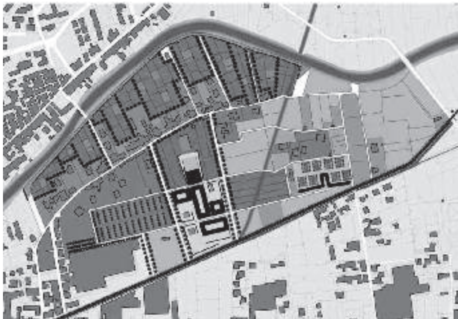
Figure 6: 2. The Center.