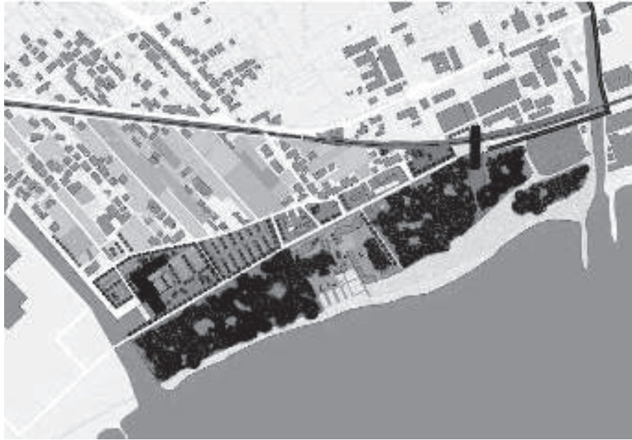
Figure 5: 1. The Mouth.