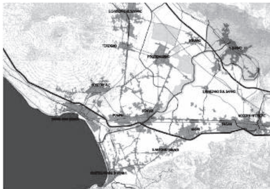
Figure 3: The Sarno Plain today.