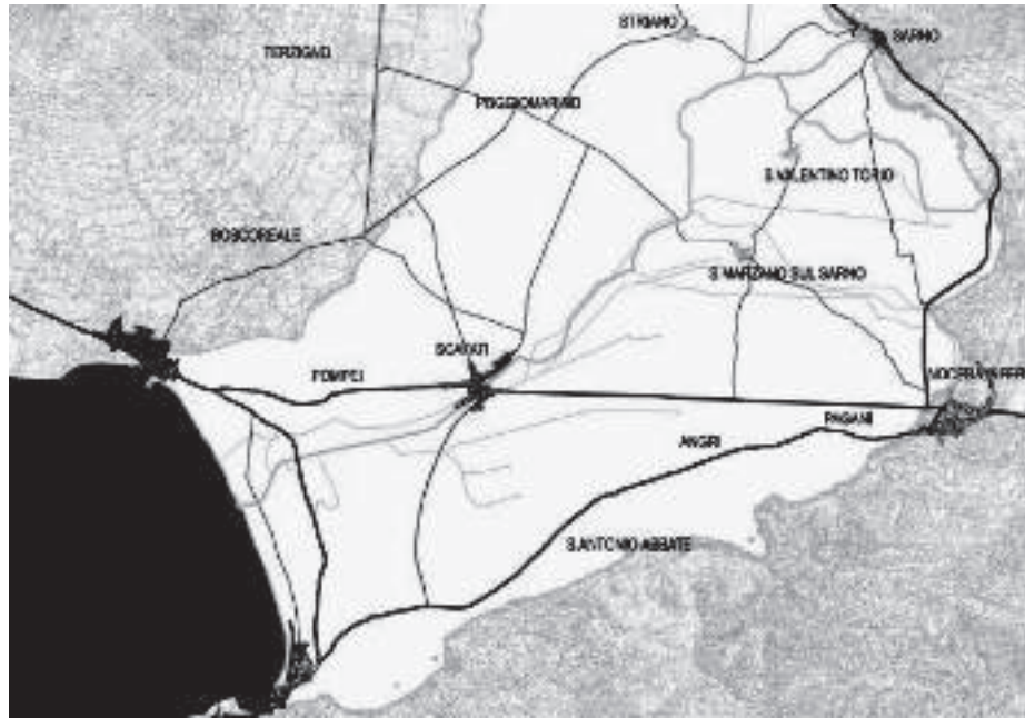
Figure 2: The original structure of the Sarno Plain.