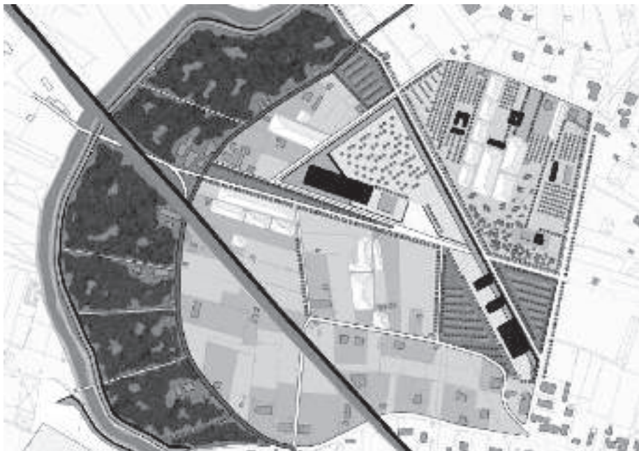
Figure 8: 4. Nature and Archaeology