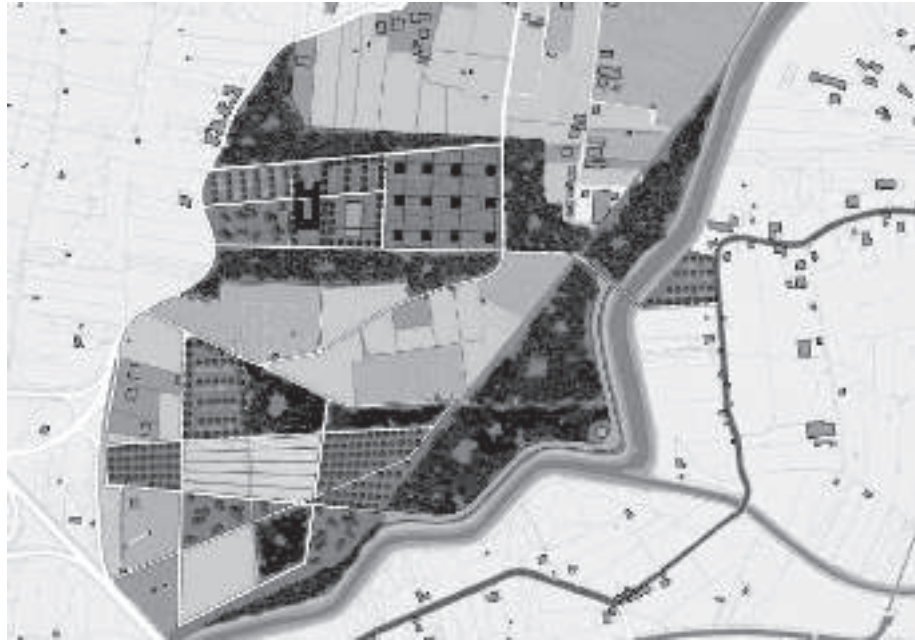
Figure 7: 3. The Knot of Water.