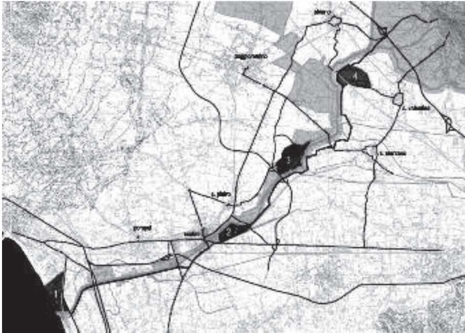
Figure 4: The Design of the Plain.

mountains. So it reconnects the coast and the mountains - the two limits of the plain – with a clear sign of orientation and crossing that allows a continuous relationship with the river, now lost, and systematizes the plot of the minor roads.