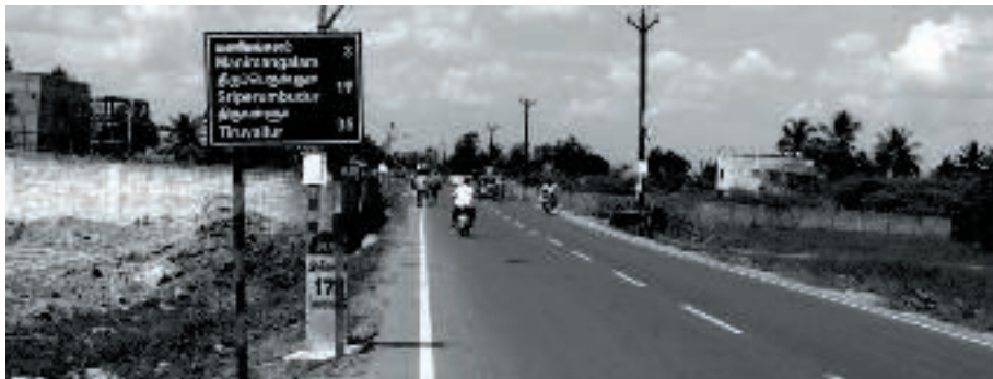
Figure 4: Approach road from Tambaram, Chennai