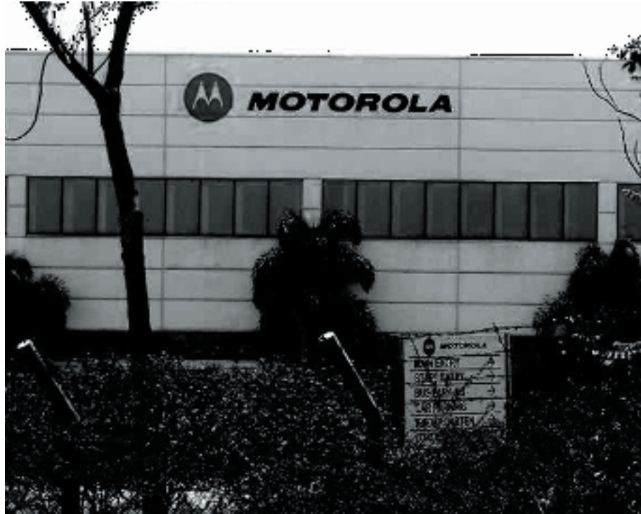
Fig. 8: Industrial landuse