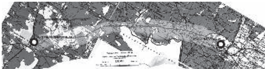
Figure 2: Sriperumpudur to Poonamalle Stretch.