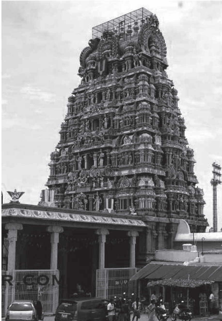
Fig. 6: Adhikesava Temple Sriperumpudur