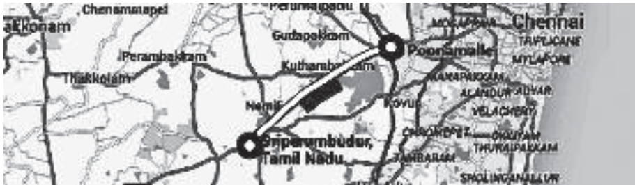
Figure 3: Location of the stretch Sriperumpudur to Poonamalle from the coast