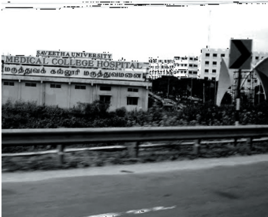
Fig. 7: Institutional landuse Saveetha Medical College, Sriperumpudur

Issues In Indian Cities Due To Increasing Coverage Of Highways: A Case Study Of The Sriperumpudur – Poonamalle Stretch In Nh4