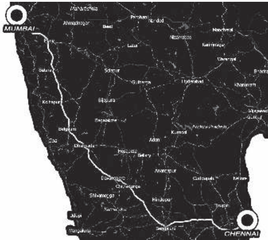
Figure 1: NH4 from west (Mumbai) to southeast (Chennai) India.