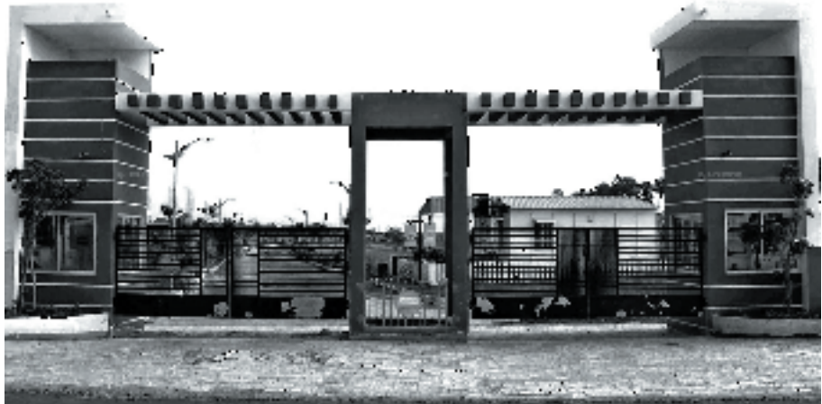
Fig. 7: Residential landuse